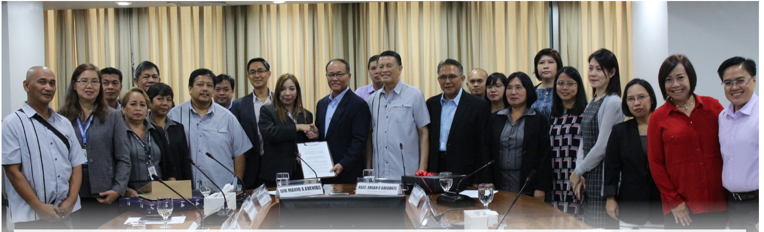
PSMBFI and LTO employees together to mark the start of a fruitful partnership.